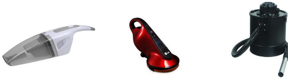
Left to right: hand-held vacuum cleaner, mattress cleaner, ash cleaner

The appliances depicted and described below are not explicitly mentioned in Article 1, but they are also out of scope for the reasons provided below.